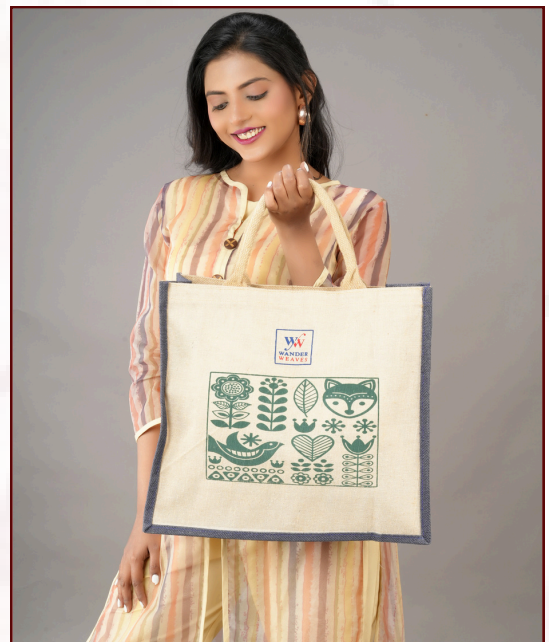
Beige coloured Jump suit with Organza Layer (Shrug)