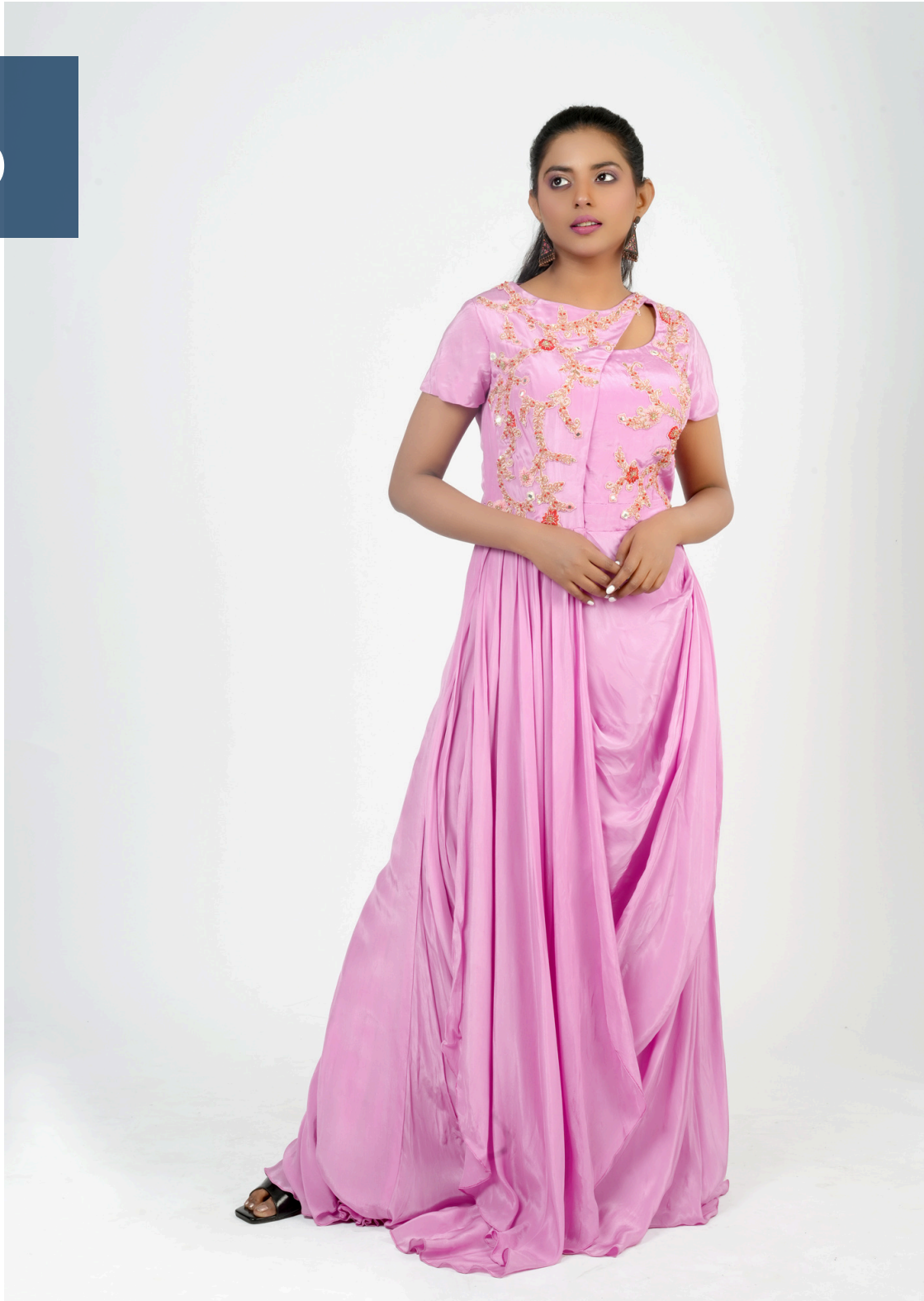
Pink embroidered Indo-Western gown