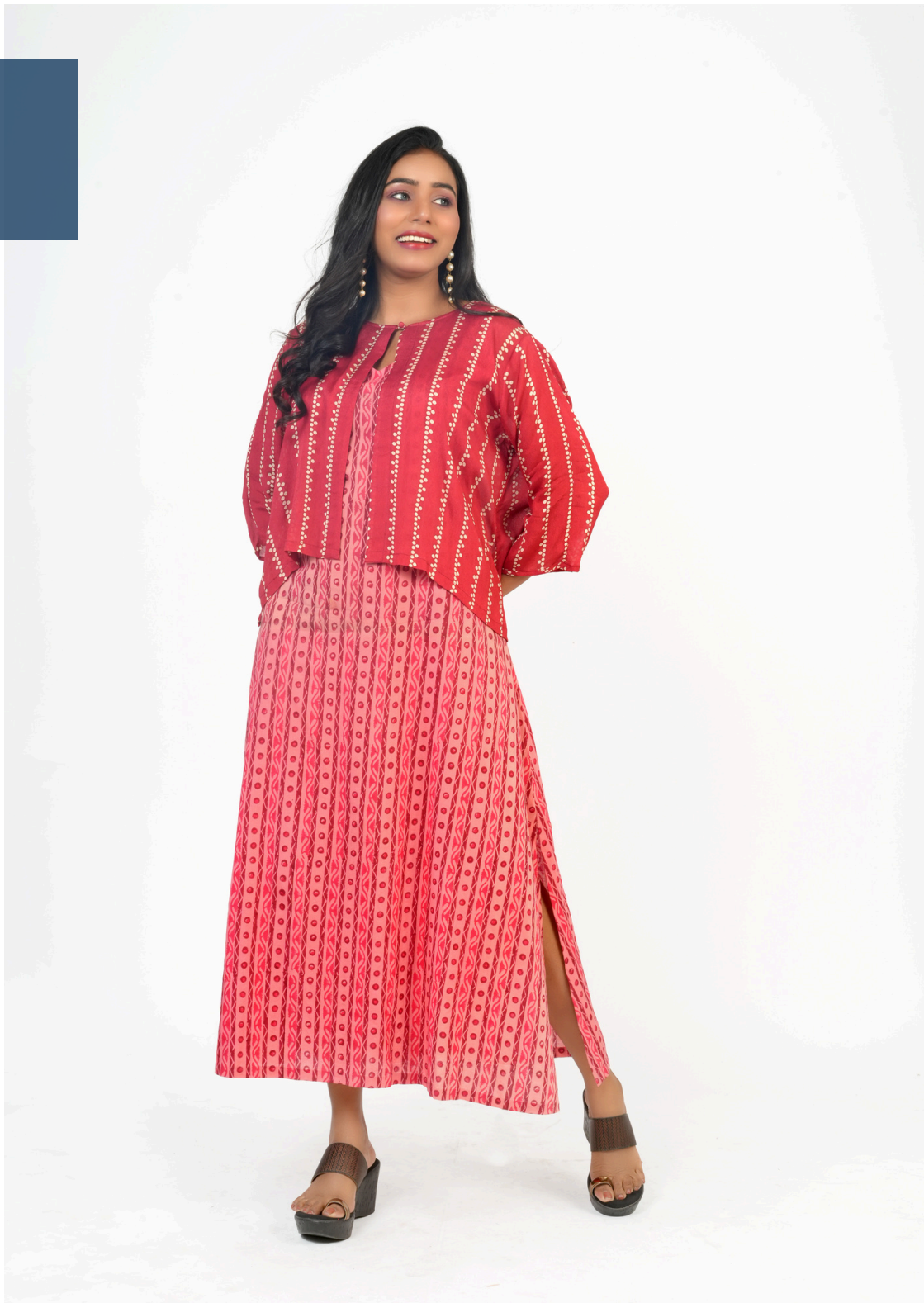
Printed crimson sober Pink Kurti