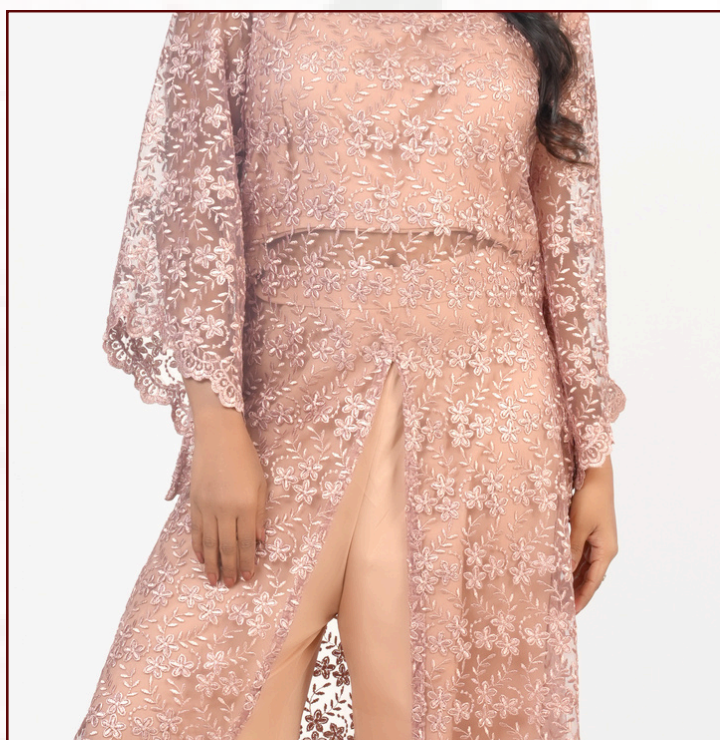
An exquisitely beautiful Pakistani Suit (with Palazzo)