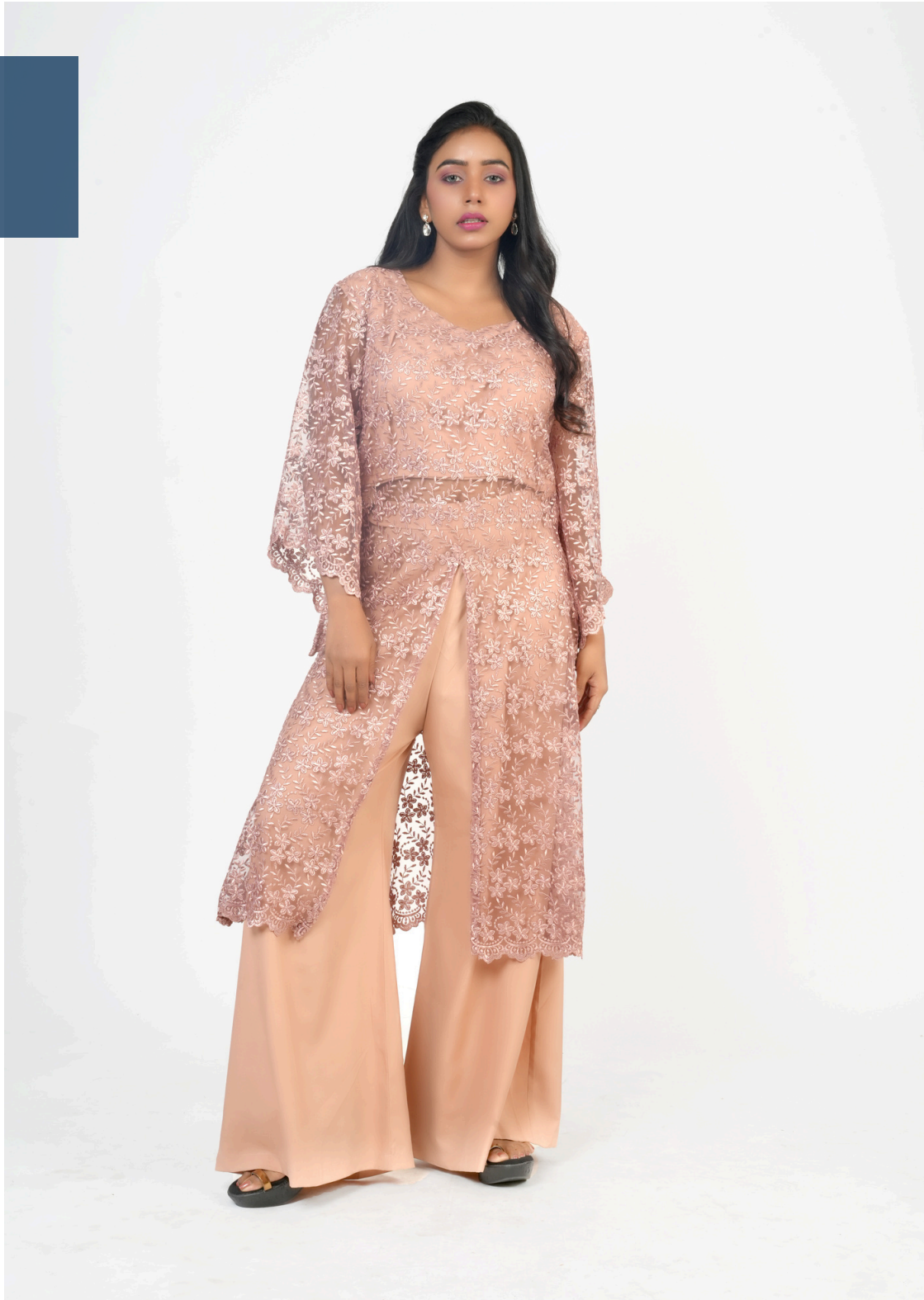
Pakistani suit with Palazzo