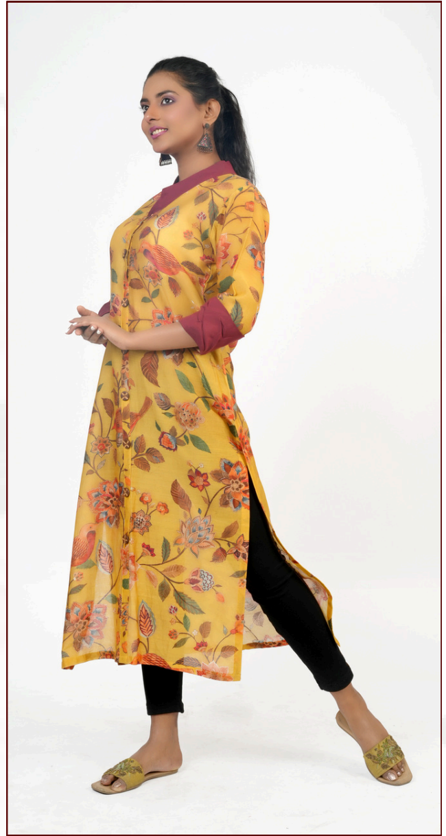
Mustard colour Russian Silk Kurti