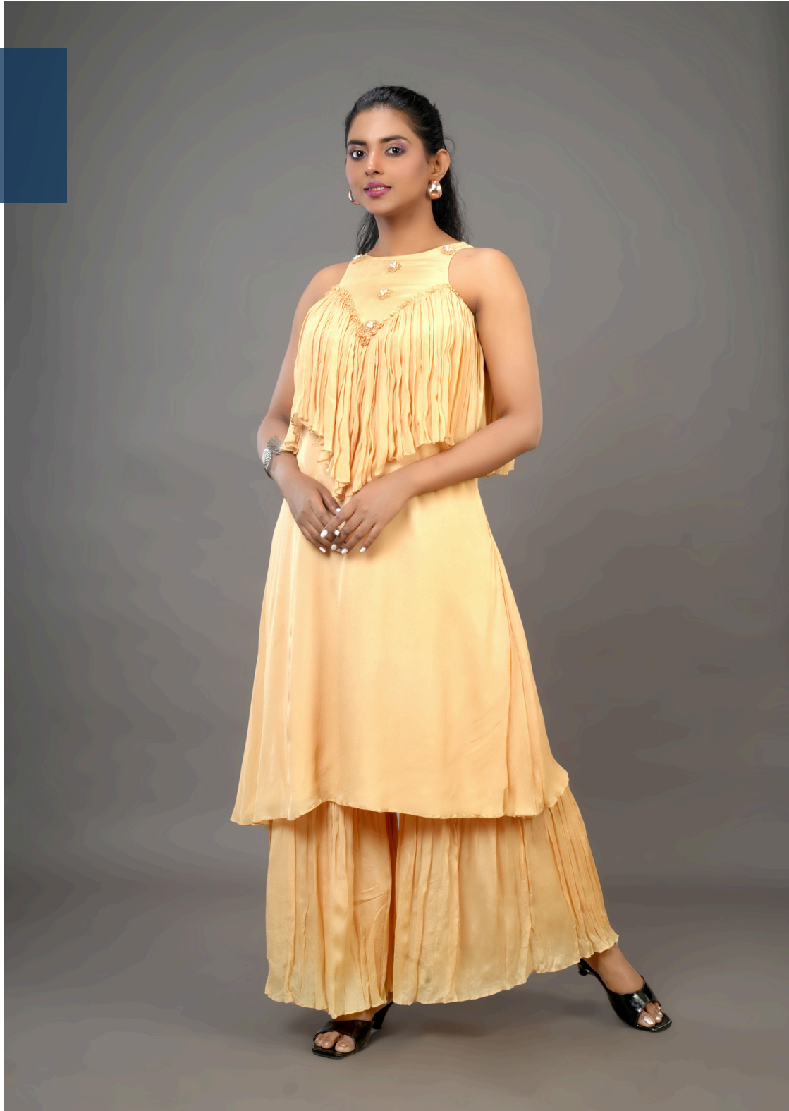
Designer kurti with sarara