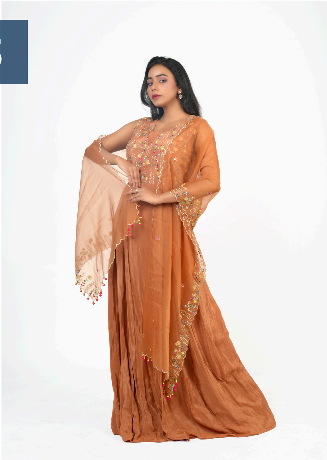
Embroidered beige coloured gown