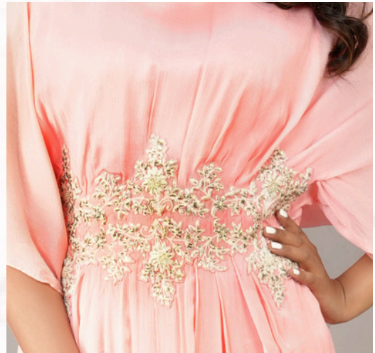
Designer Pink colour Chiffon Drape Dress with pant