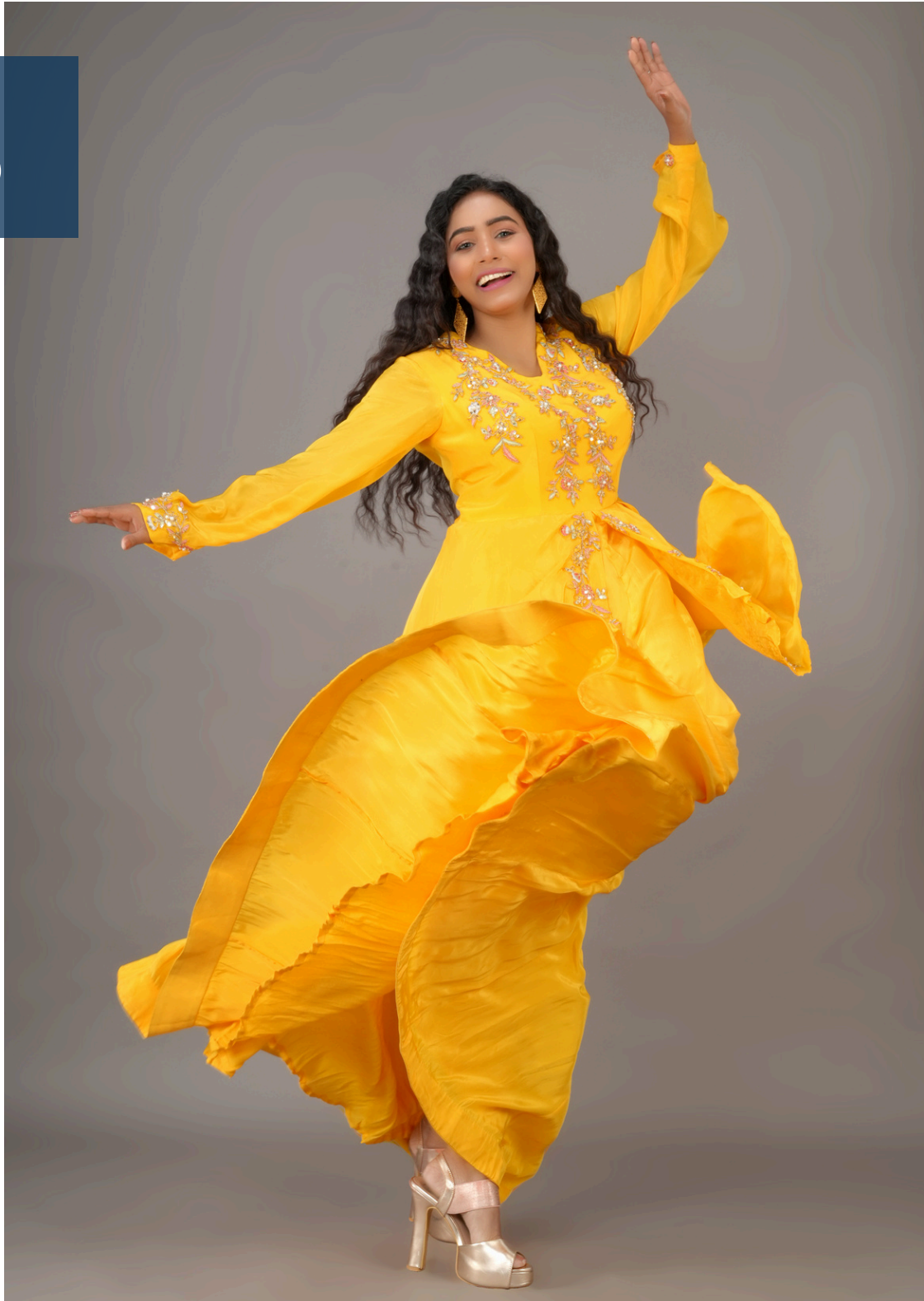
Mustard yellow Crepe designer long gown