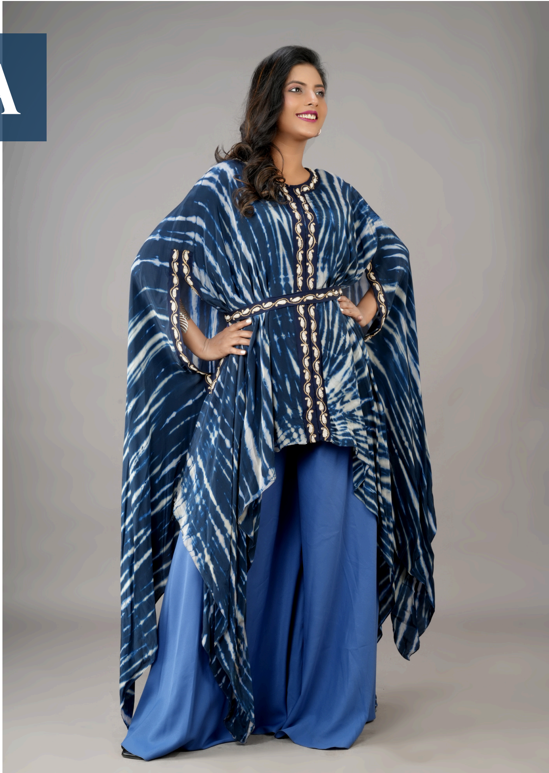
Tie & Dye Blue Kaftan Kurti