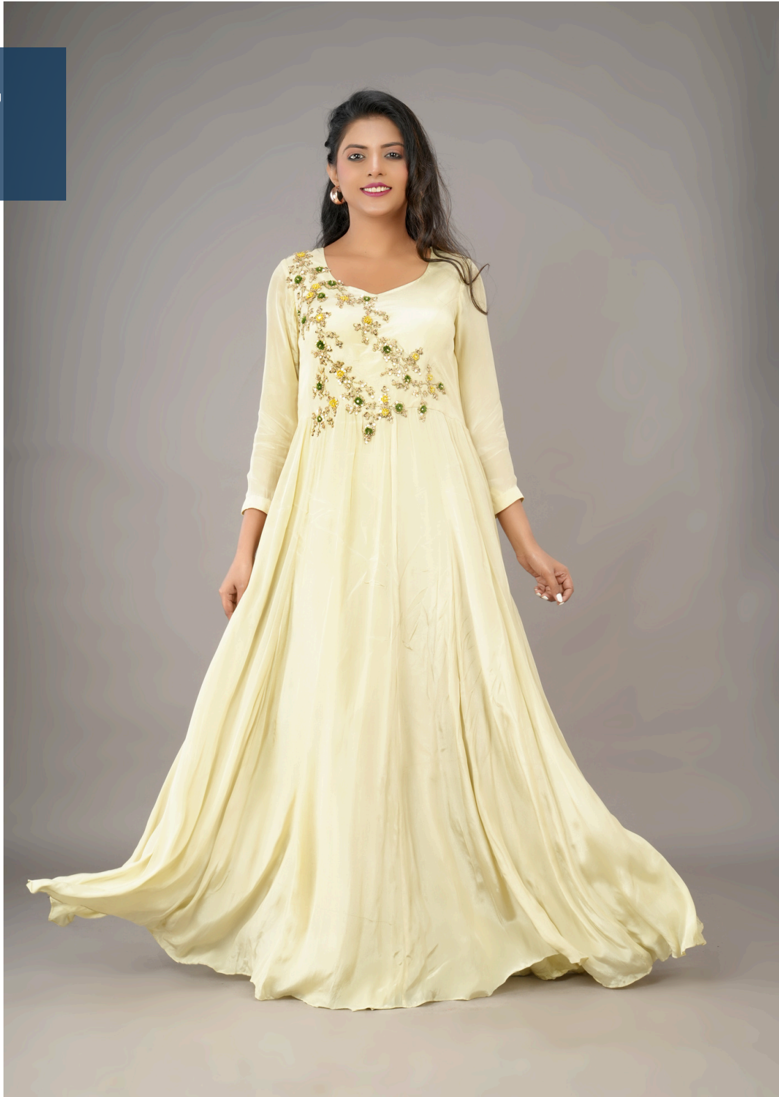
Chinon Sweet Peach coloured