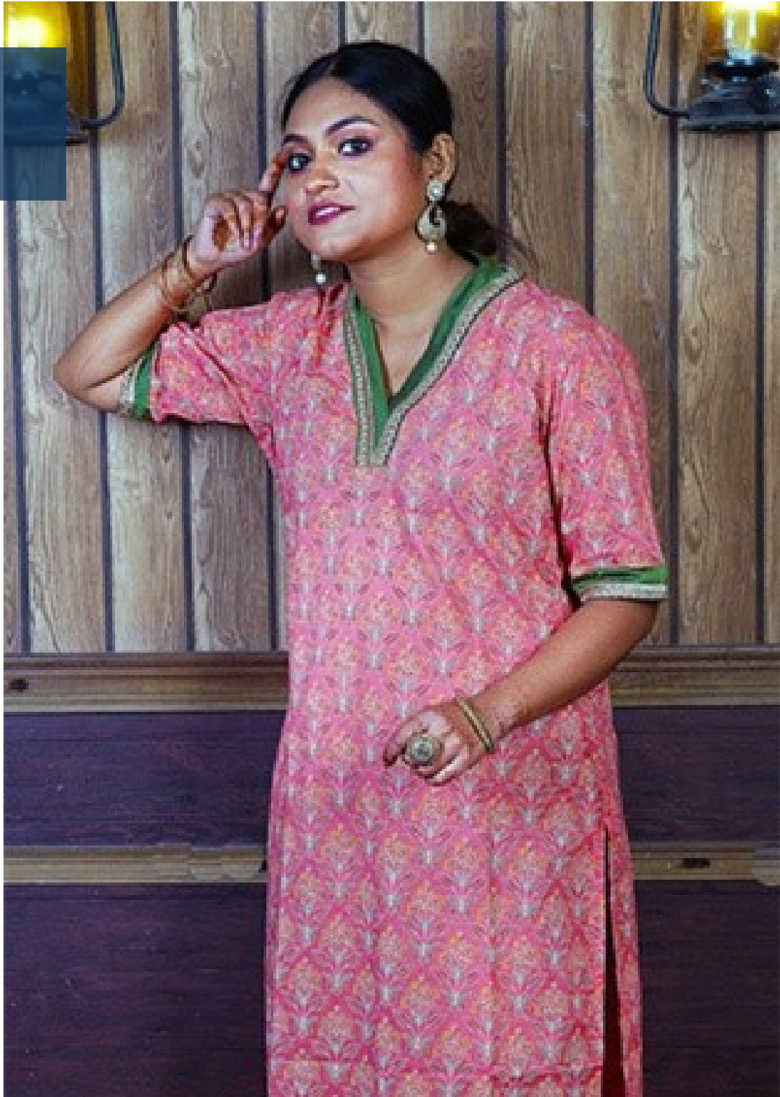
Premium cotton printed Kurti with Zari work