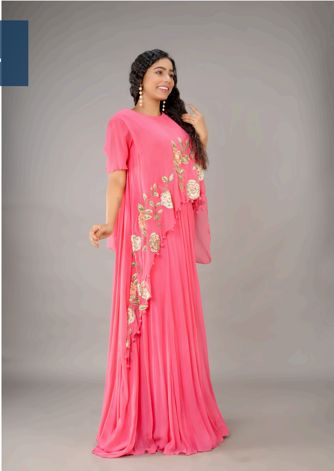
Sweetie Pink Drape dress