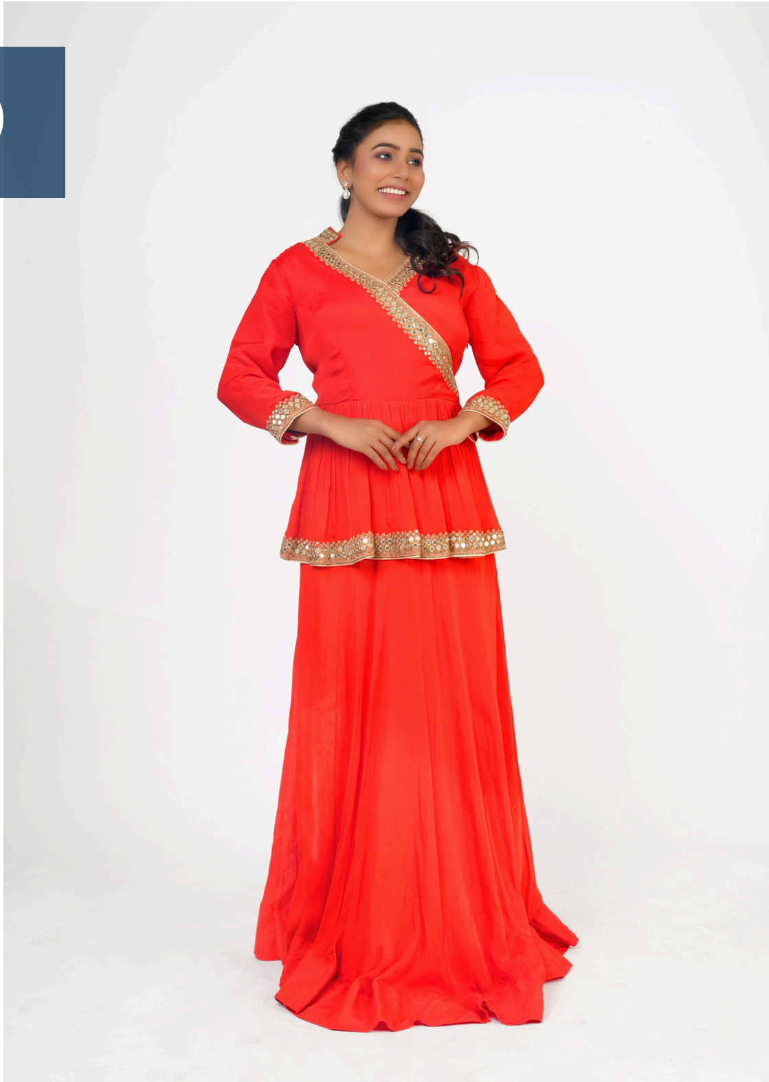
Red Chinon pleated Top and long skirt