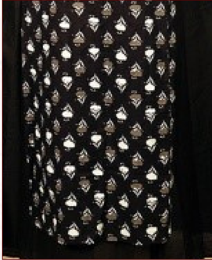
Black Printed premium cotton Layered dress/Kurti