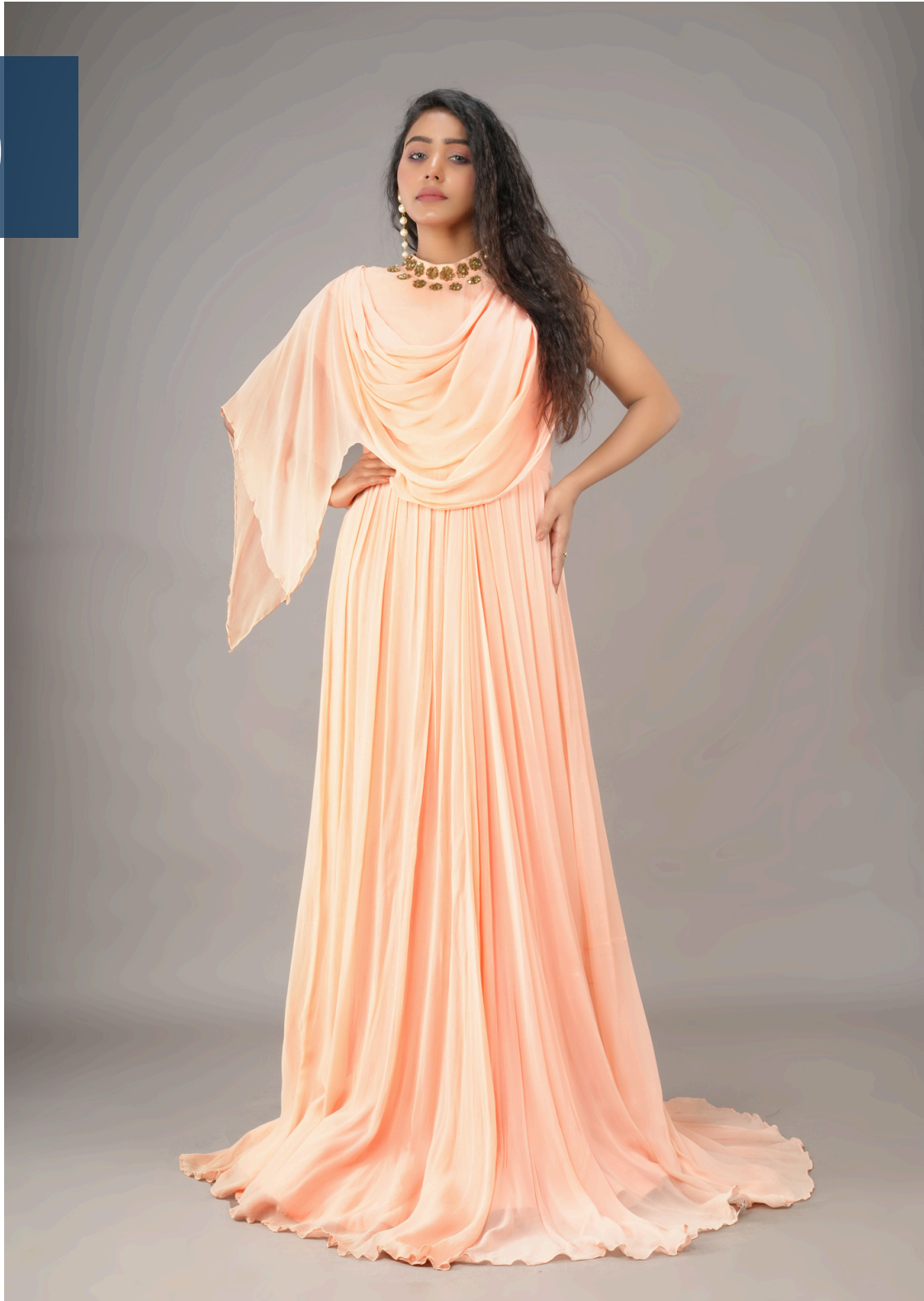
Peach coloured Georgette drape dress