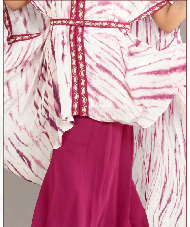
Crepe Tie & Dye Embroidered Kaftan with Skirt Palazzo