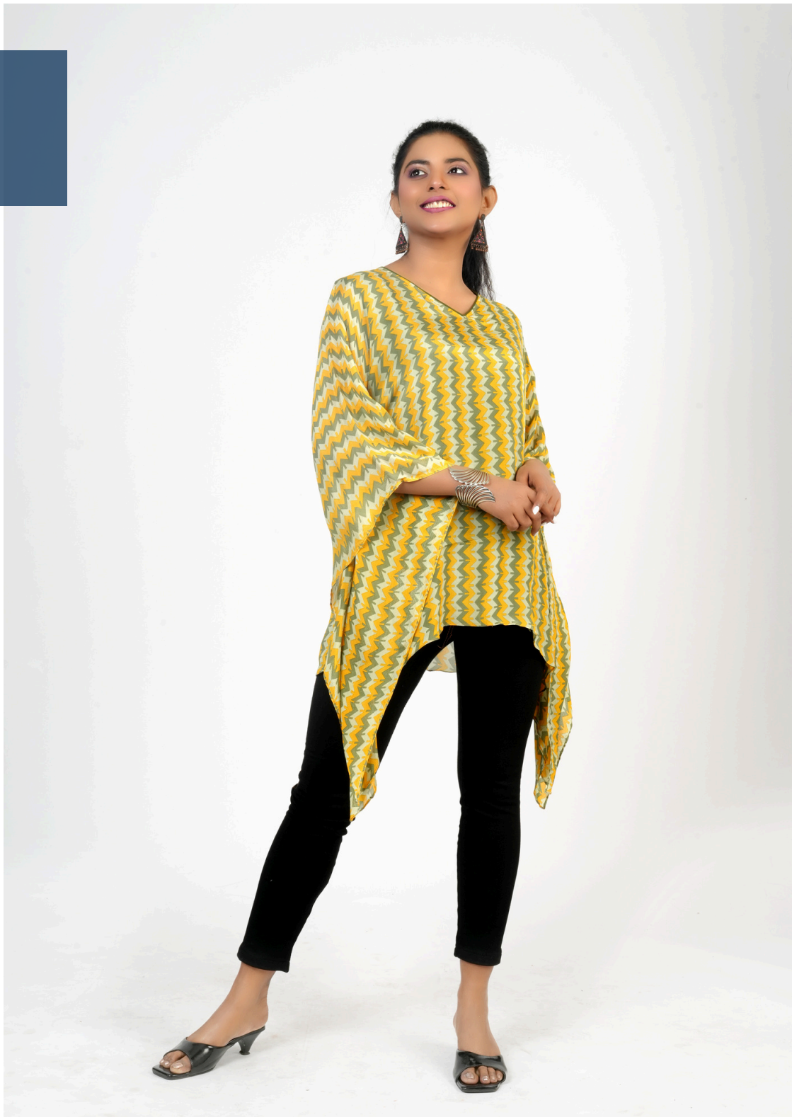
Kaftan Top, Georgette with lining