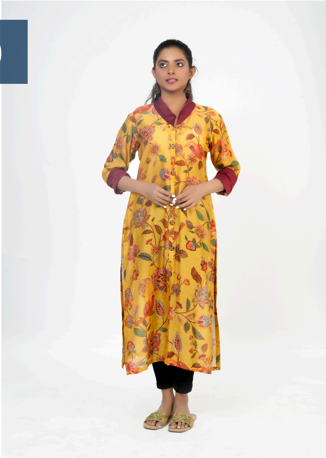
Russian Silk Kurti