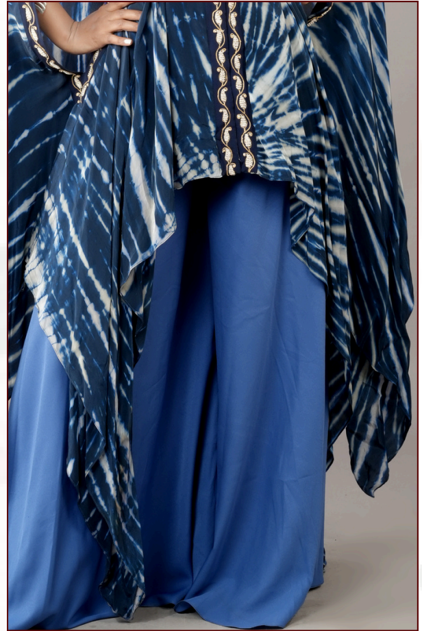
Tie & Dye Blue Kaftan Kurti & Palazzo with highlights & embroidered borders