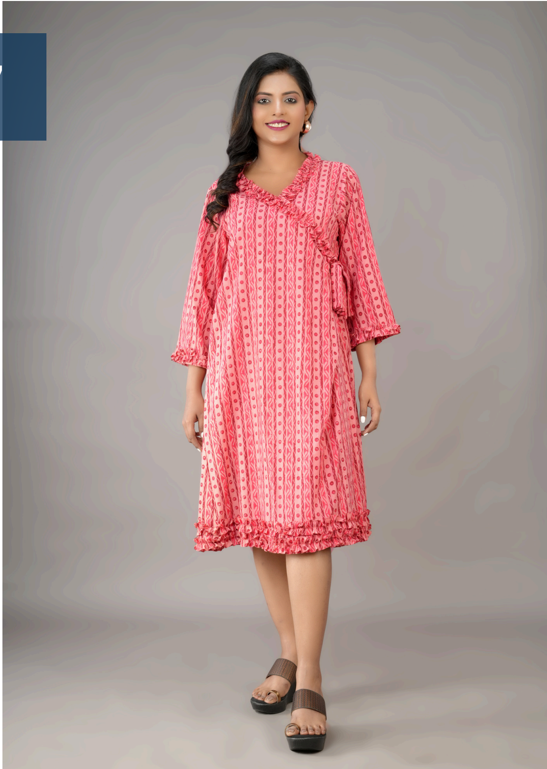
Printed pink Premium cotton midi dress