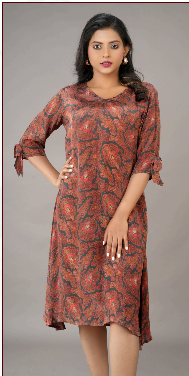
Printed Crepe Midi dress/kurti