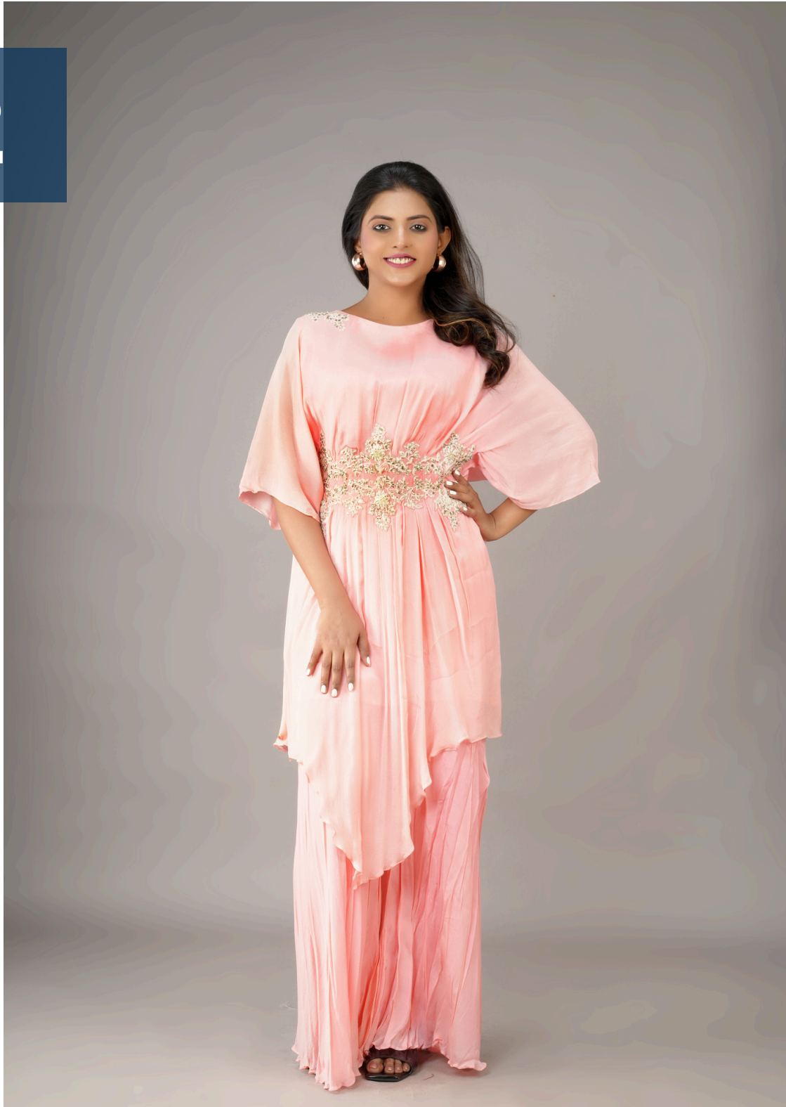
Chiffon Drape Dress With pant