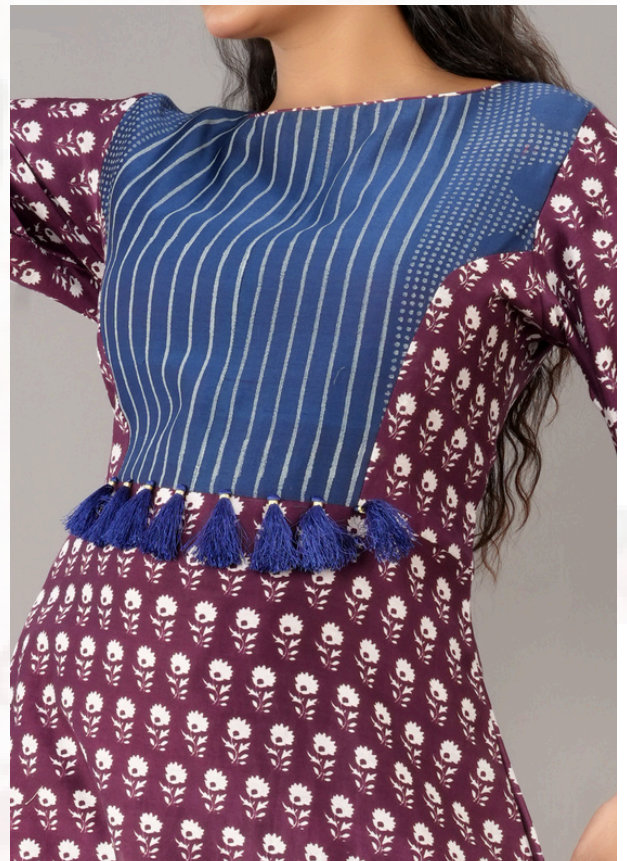
Chanderi Suit Maroon