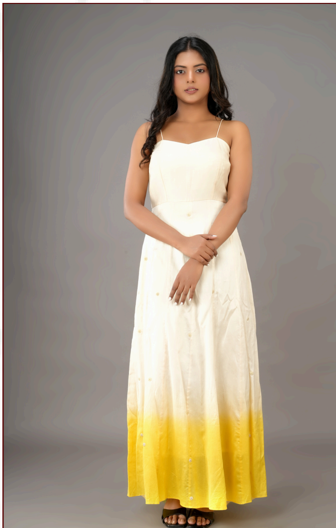
Chanderi Long Dress with Noodle strap, Net and Chanderi combined Blouse and Dupatta