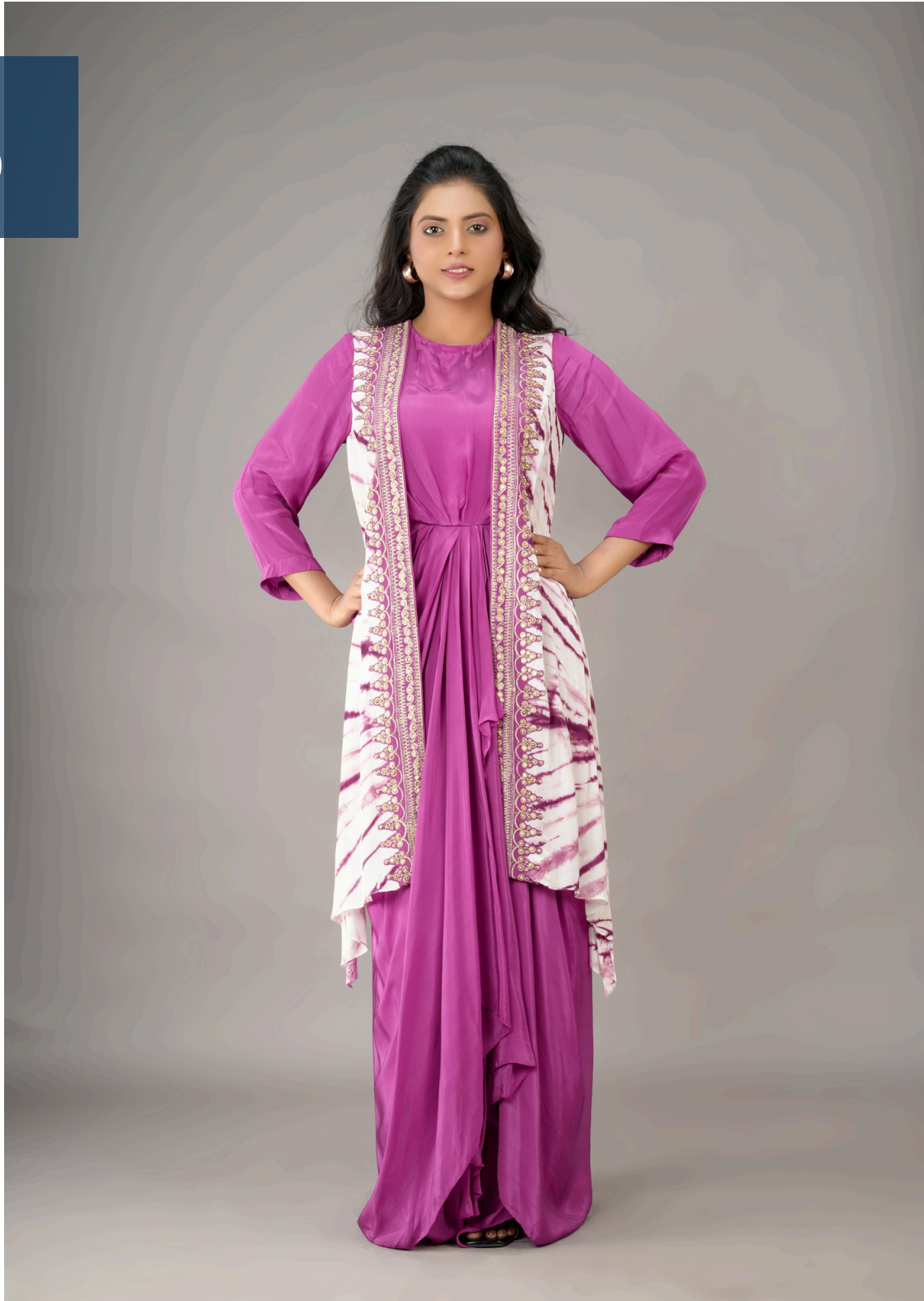
Purple Gown with zari embroidery