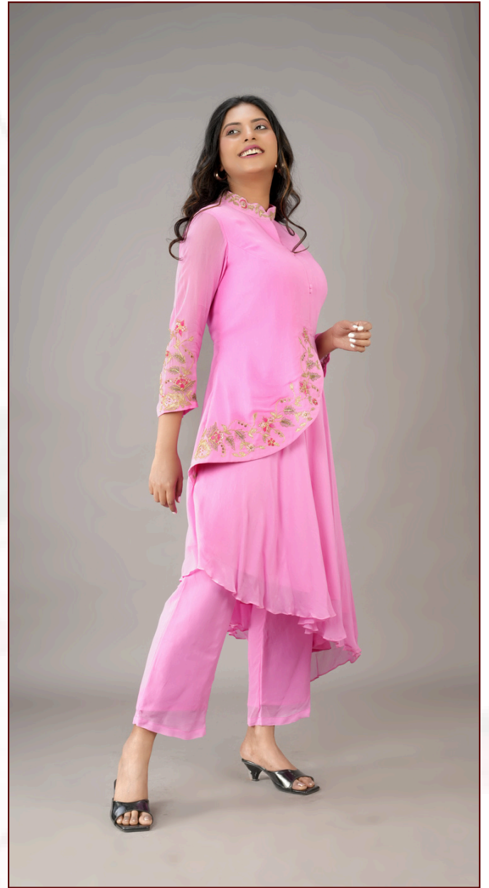
Pink Coloured Georgette Drape Suit