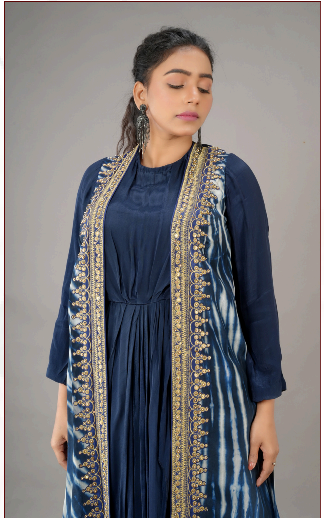
Tie & Dye Blue Kaftan Kurti & Palazzo with highlights & embroidered borders