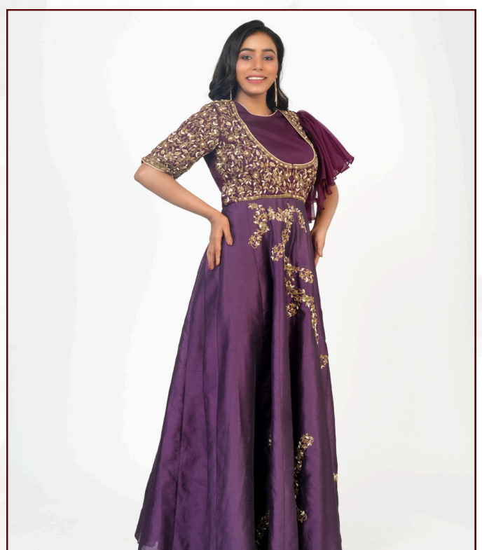
Designer Dark purple long gown ornated with antique zari embroidery