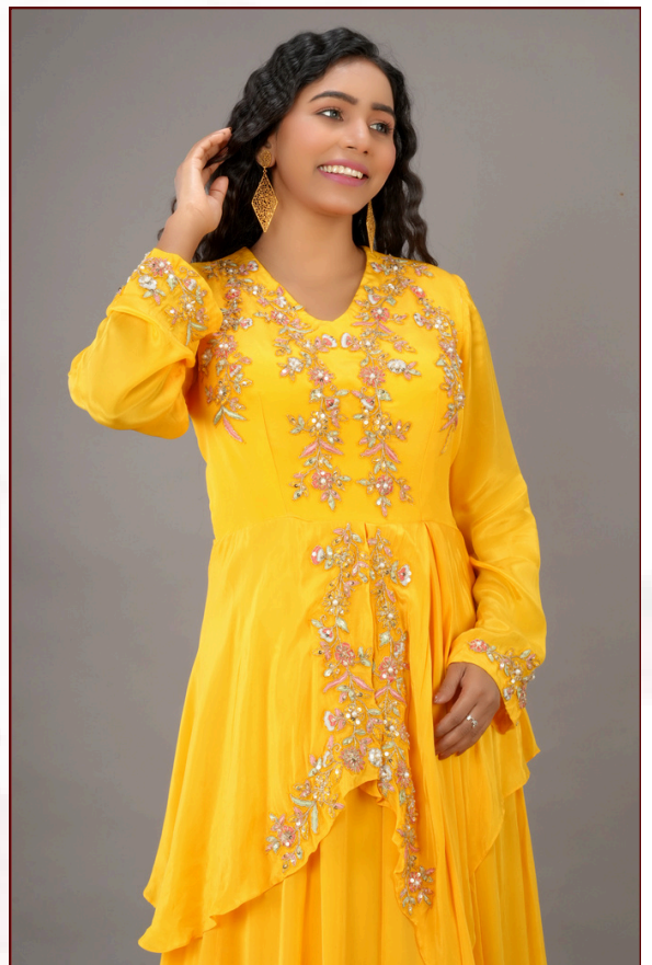
Mustard yellow Crepe designer long gown/dress with rich embroidery