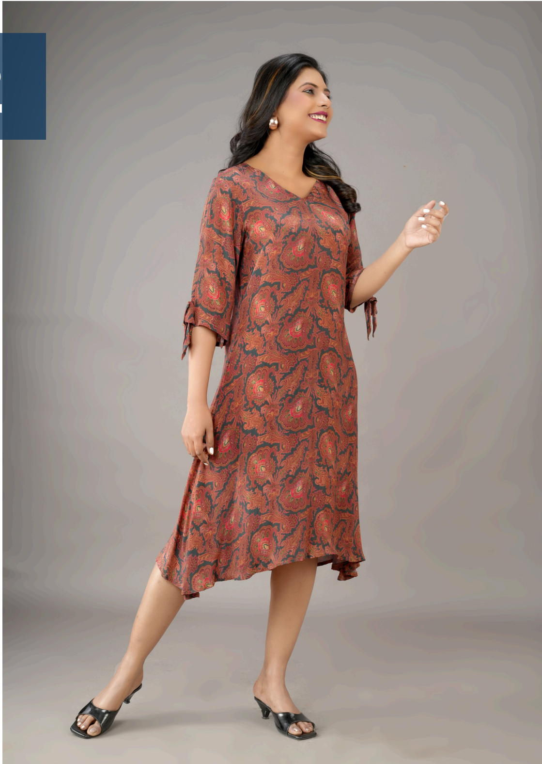
Printed Crepe Midi dress