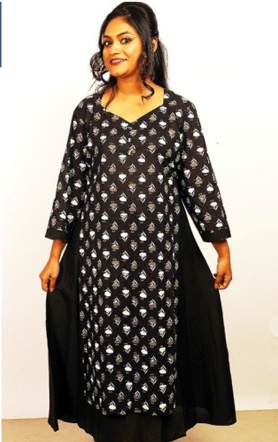
Black printed premium cotton layered Kurti