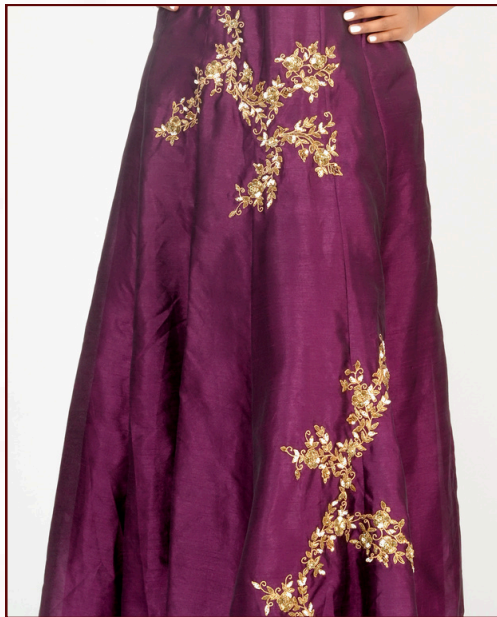
Designer Dark purple long gown ornated with antique zari embroidery