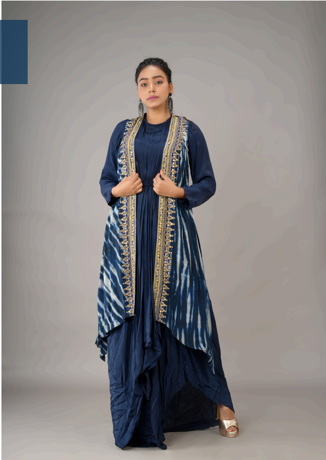
Tie & Dye Blue Kaftan Kurti