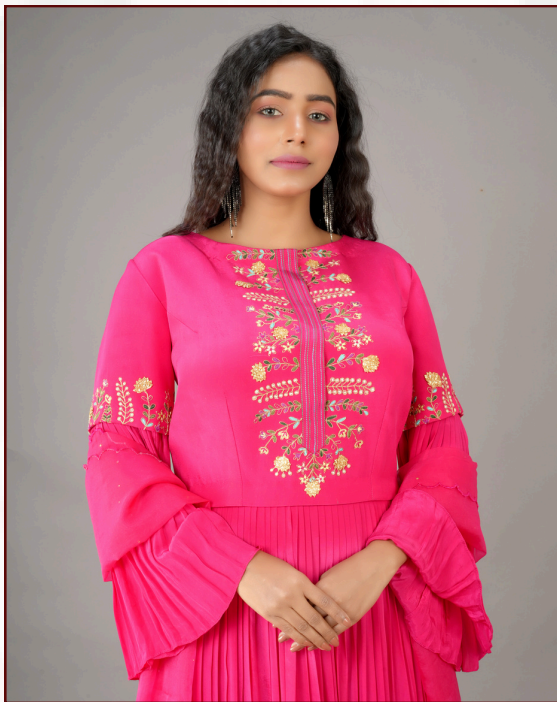
Dark Pink Embroidered Drape Dress with Dupatta