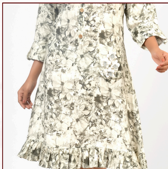
Linen Shirt style Midi Dress