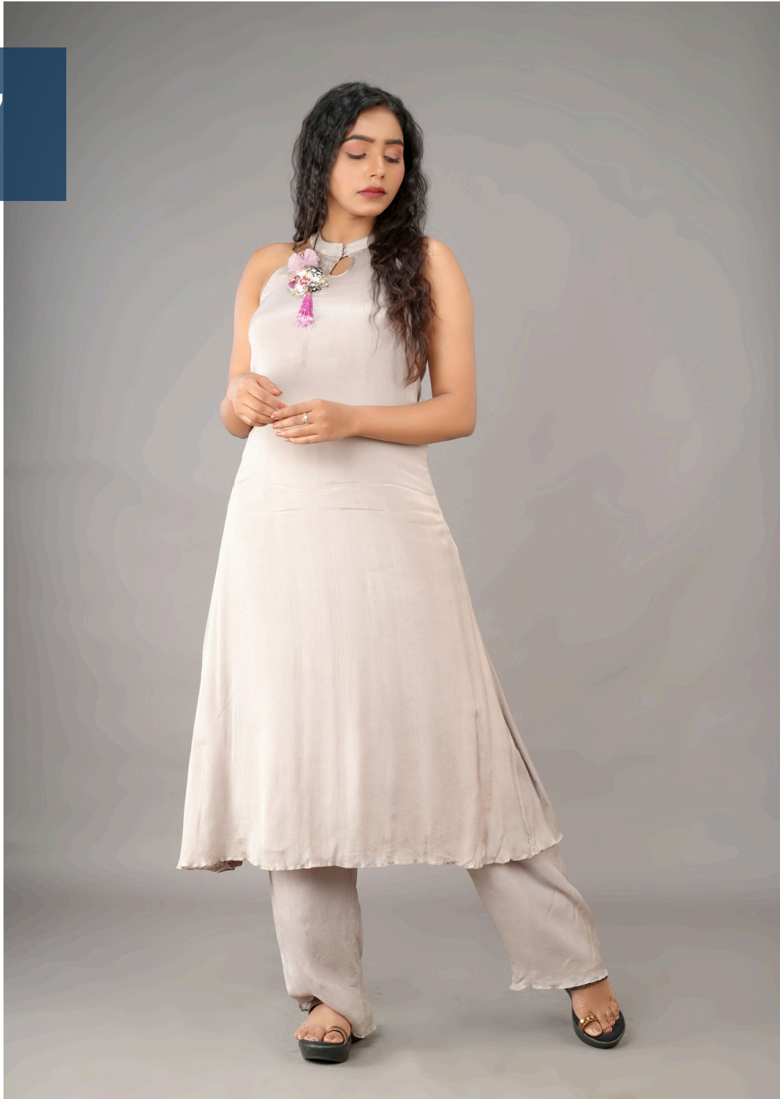
Sleeveless steel grey Suit gorgette kurti