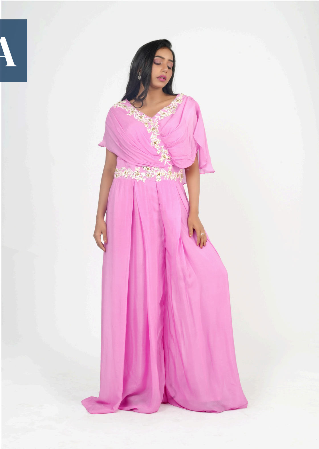
Pink embroidered Indo-Western gown