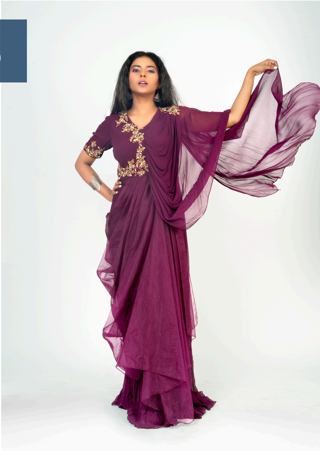
Dark Berry purple georgette long gown