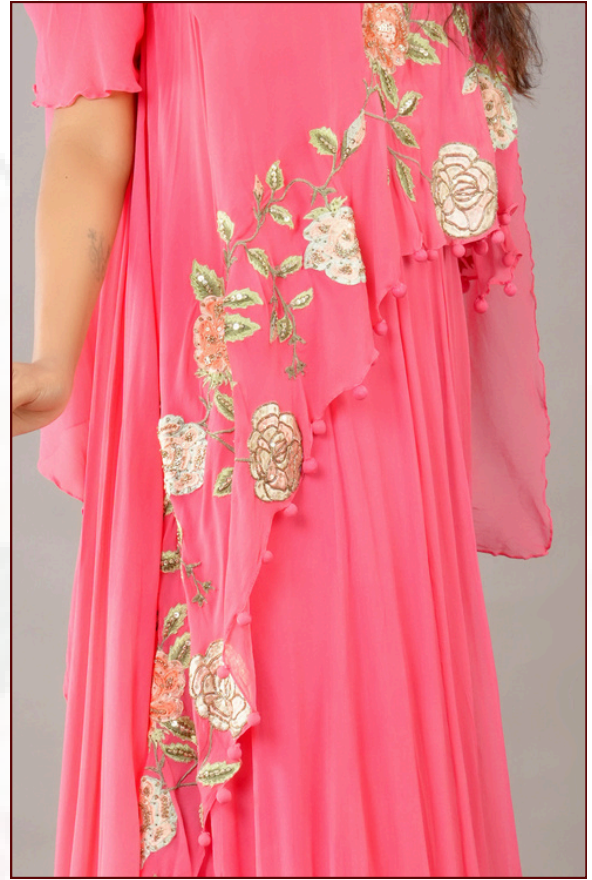
Sweetie Pink Drape dress with a garden of beautiful flower embroidery